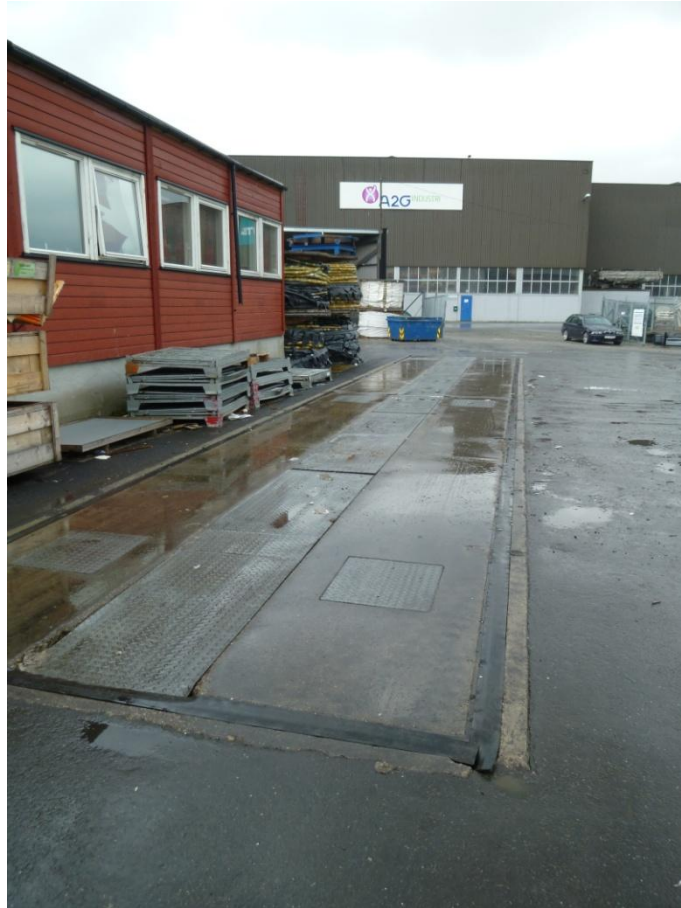
Figure 2: Weighbridge at Stena Recycling. The weighbridge and its load plate has good shield against moderate wind.