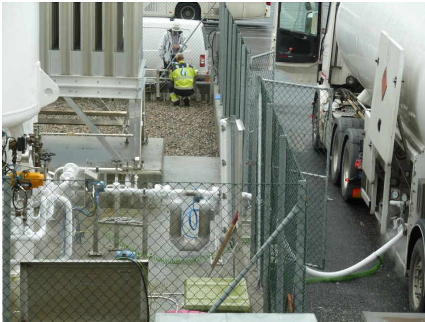
Figure 7: LNG transfer from road tanker to stationary tank at LNG terminal