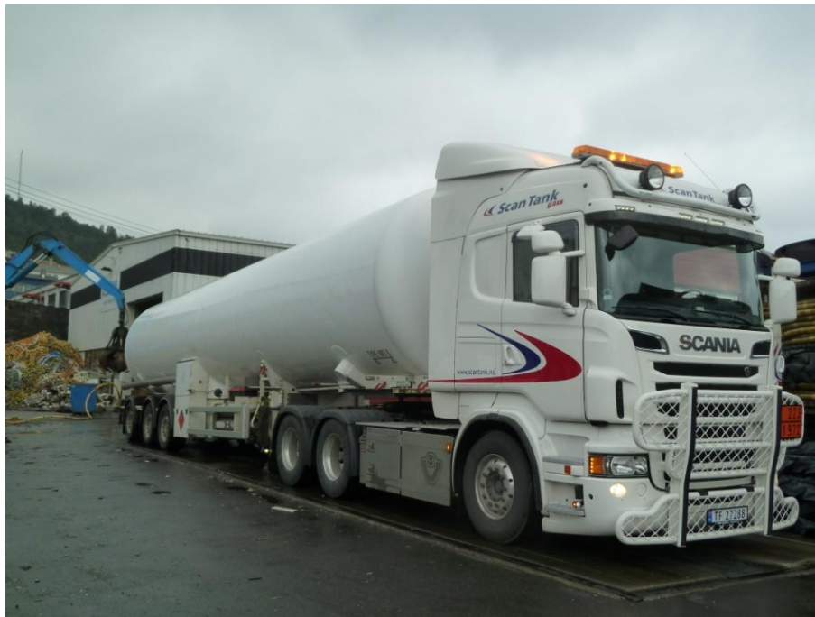
Figure 1: LNG road tanker (tractor plus semi-trailer) on weighbridge at Stena Recycling, Laksevågneset.

under normal circumstances is less than 0.3 bar per 24-hour period and the excess pressure buildup is released during transfer at the receiving terminal.