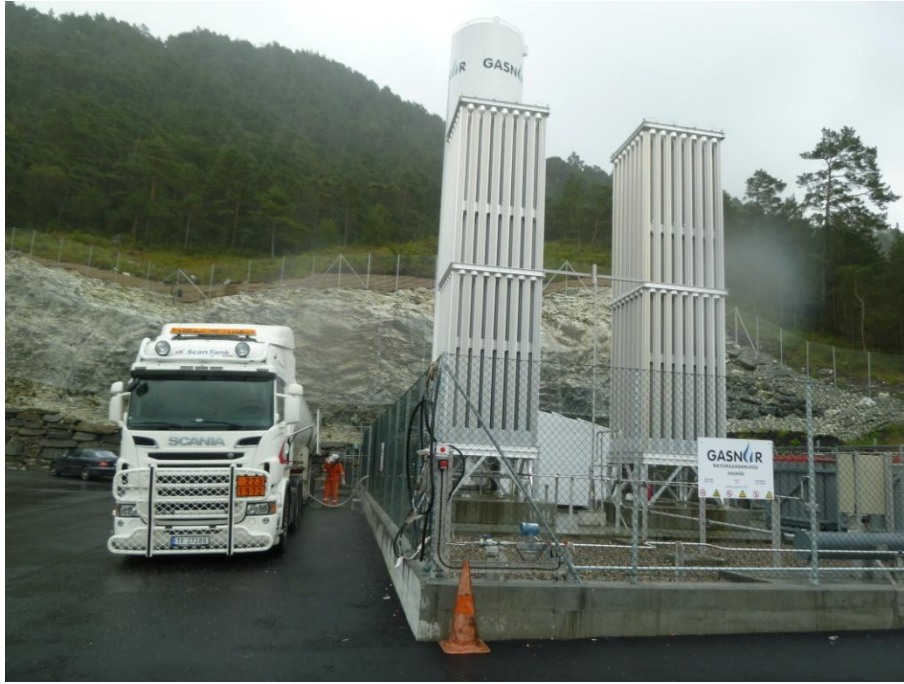
Figure 3: LCNG terminal at Haukås. Transfer of LNG from road tanker to storage tank.