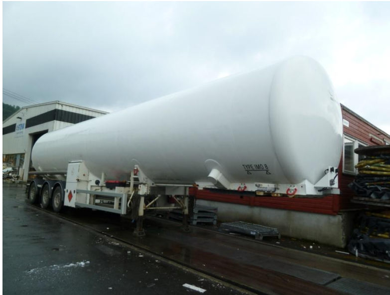
Figure 6: Weighing of road tanker semi-trailer at Stena Recycling